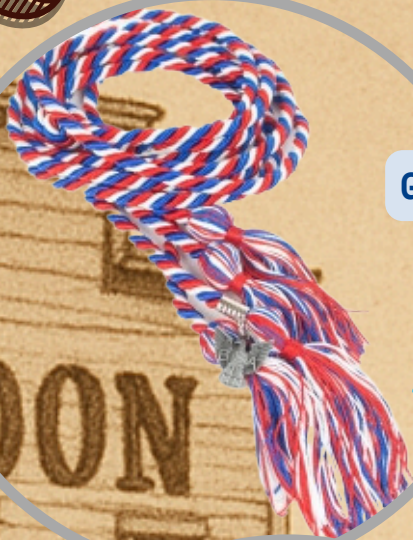
Eagle Scout Graduation Honor Cords

Hours of Operation Monday - Friday 8:30am - 5pm (CST)