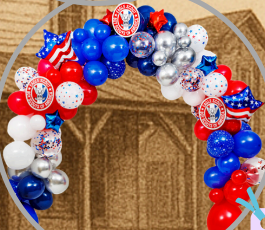
Eagle Scout Balloon Arch Kit

To place an order call 812.423.5246 fax 812.423.4845, or email administration@buffalotracecouncil.org